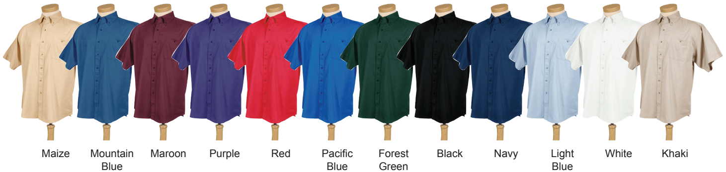
Maize Mountain Blue Maroon Purple Red Pacific Blue Forest Green Black Navy Light Blue White Khaki