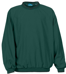
Forest Green/ Black